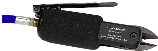
SP-01P with Optional PGC-2