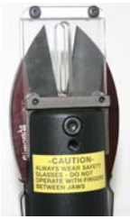
Left is picture of SG-3 Guard for B-Series Jaws

B- series jaws are hardened and ground for semi-flush cutting of mild wire up to 0.25". Cutting edges are parallel with axis of housing actuator. The B-38 jaw is designed to cut 3/16" (4.76 mm) air craft cable.