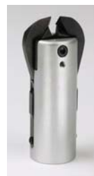
D-Series Semi-flush cutter, set at an angle of 25° or 45° to allow access to vertical screws, wires, etc.