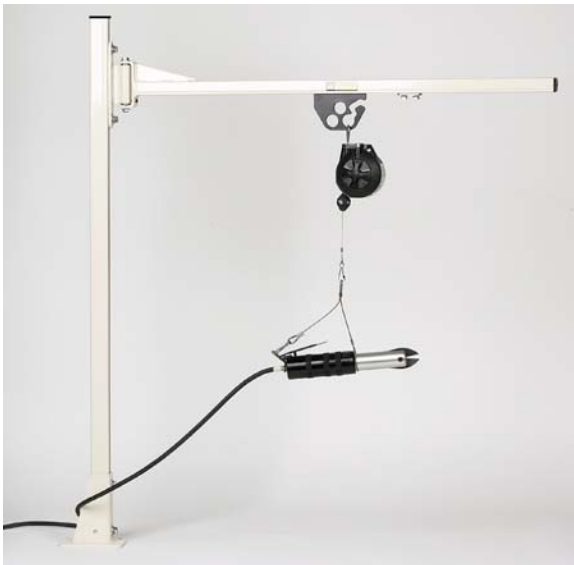
Optional tool balancer and harness shown in picture sold separate

Simonds line of ergonomic support systems is for use with any remote power pack or jaw set combination. Helping to relieve the strain and fatigue of hefting a power pack all day, these systems will help improve productivity while eliminating injuries through ergonomic design. The optional tool balancer and tool harness is made for holding the power pack and jaw set in a horizontal position.