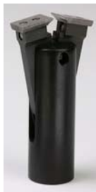
C-Series End cutting jaws. Jaw sets have removable inserts for end cutting mild steel up to 1/8" diameter. Use only with SP-002 power pack